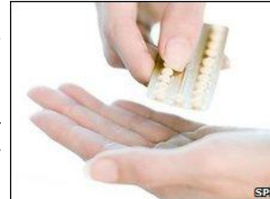
The pill: a medication or a lifestyle choice?

It is 50 years since the pill was first approved as a contraceptive, finally divorcing sex from pregnancy. But half a century on, our relationship with the tablet credited with revolutionising women's lives is not always an easy one. On 9 May, 1960, the American authorities announced they would allow a hormonal pill previously used for gynaecological complaints to be prescribed as contraception. Over the next decade, a string of other Western countries from Australia to the UK would follow suit. Science, changing social attitudes and even fears about overpopulation in communist states all conspired to make the pill possible.